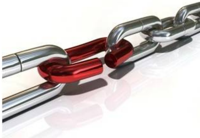
Fig. 1 Weakest link in the chain

A system is generally defined as a collection of interrelated, independent processes that work together to turn inputs into outputs in the pursuit of some goal. As pictured above, the chain has one “weakest link.” If force is applied to the chain at an increasing rate, it would eventually break at this point. Therefore, the weakest link is the constraint that prevents the chain (system) from doing any better at achieving its goal (transmitting force).