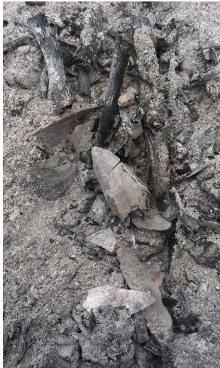
Fig. 5: Experimental burning of blue mussel ( Mytilus edulis ) shells

In studying shell middens, the question of their purpose must be raised. The described examples of dealing with what is more-or-less waste material indicate deliberate management practices.