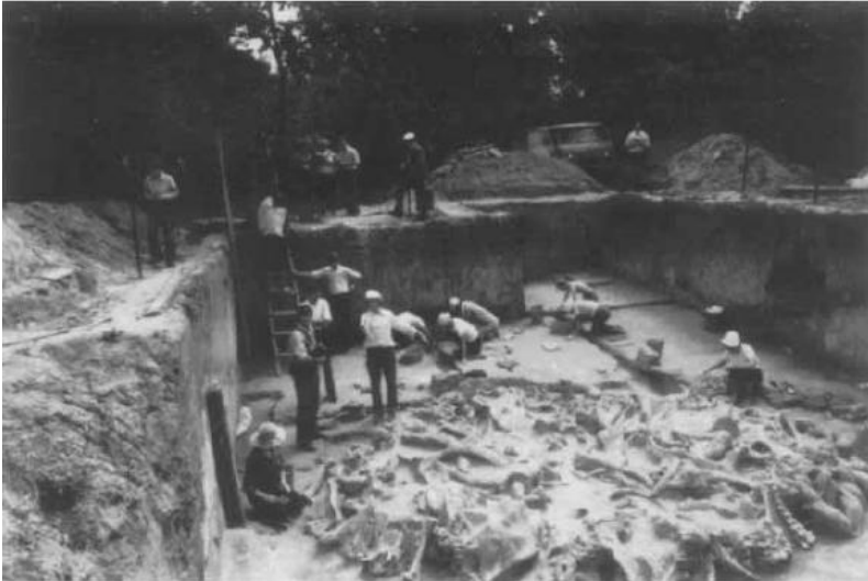
Fig. 1: Excavation of a mammoth bone accumulation in Mezine, Ukraine (Soffer et al. 1997)

Accumulations of large, predominantly mammoth, bones are worthy of particular attention. In Central Europe, at a site in Dolní Věstonice an accumulation of mammoth bones (a 12 m wide and 45 m long accumulation of 40 cm thick bones) was discovered. The leader of the excavation interpreted it as a waste heap (Absolon, 1945). Another excavation leader, Bohuslav Klíma, shared the same opinion (Jelínek, 1977). Two theories about “waste” in Paleolithic settlements exist. (There is perhaps even a third theory that combines the first two). On the one hand, this “waste” could be the remains of a hunt. On the other hand, hunters and gathers could have built their camps near carrion in order to obtain raw materials (see Oliva, 2003). There is most likely more relevant evidence for the first theory, that is, that the bones are the remains of hunting or collecting dead animals and are the results of anthropogenic activities. 16 The question of mammoth-bone accumulations is still debated today. This question has yet to have been fully solved.