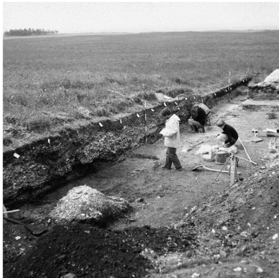
Fig. 4: Excavation of a shell midden in Ertebølle, Denmark (Gutiérrez-Zugasti et al. 2011)