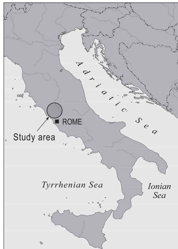
Figure 1: Study area.

the North (Fig. 1). The Tolfa-Ceriti mountains are formed mostly of trachyte stones from the Eocene and the early Pleistocene, which markedly characterise the landscape of the study area in the form of a complex of acid domes. These volcanic edifices give rise to the rugged morphology which characterises the higher altitude zones of the study area (the highest peak of Tolfa mountains is the Monte della Grazie, 616 m) and which makes them easily distinguishable from the surrounding hilly zones which are formed by older sedimentary deposits of flyschoid origin (Devoto & Lombardi 1977; Contoli & al. 1980; Angelelli