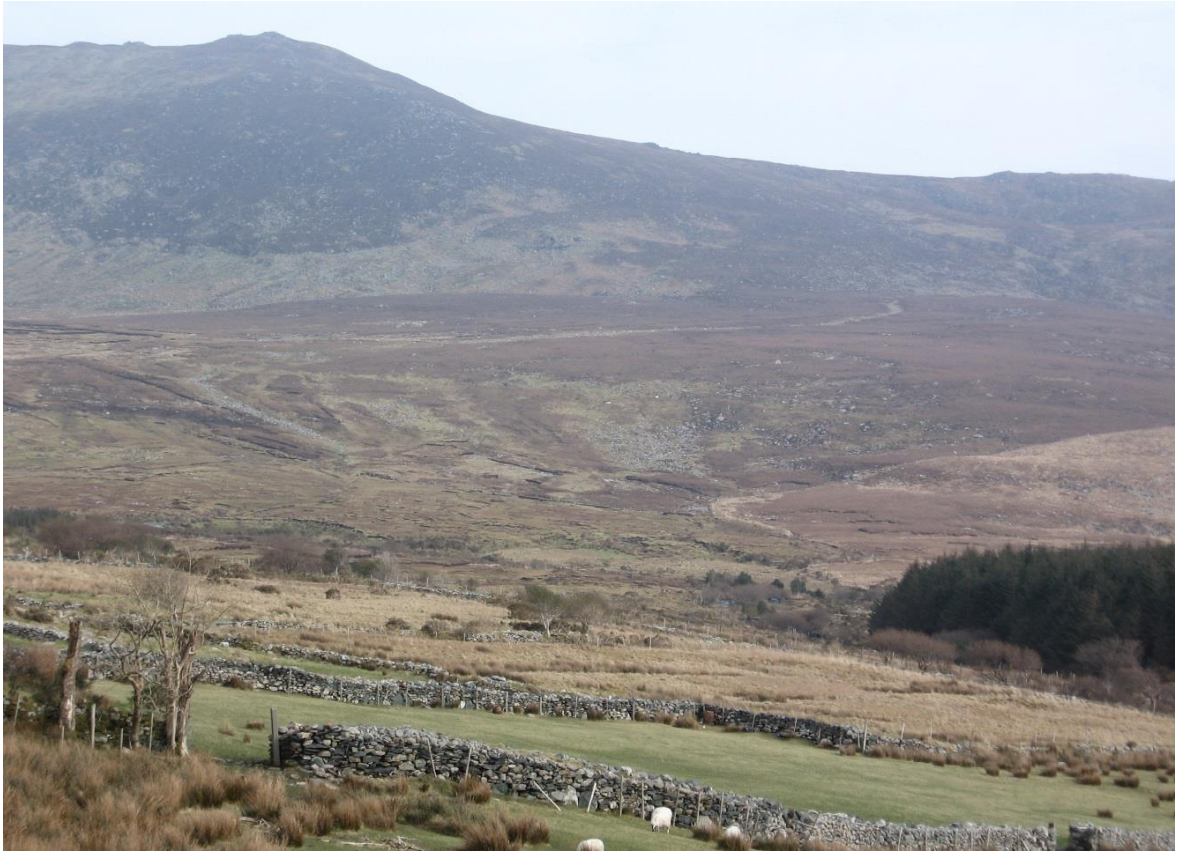
Fig 2. Coomasharn-Canearagh mountain valley with scree covered mountain and cut-over bog in the background, and rough grazing in the foreground.

Apart from the above-mentioned resident active farmers, there are four farmers from outside the valley who have bought and/or inherited land in the valley, mostly for access to commonage, and are locally referred to as 'people coming-in', and none of whom live in the valley. At the entrance to the valley, some cutover bog (with no commonage rights), was bought by outside investors some years ago, essentially for its entitlements/subsidies. This land is fenced off and abandoned. It is today covered in regenerating scrub, 'rewilding', and is seen as a potential fire risk. The area around Coomasaharn lake is particularly scenic (see Fig. 3). All the uplands in the study area are designated as Special Areas of Conservation (SAC), as defined under the European Habitats Directive (Directive 92/43, May 1992), in recognition of their internationally important blanket bog and moorland habitats. There are legally binding restrictions on development and land use within SAC areas.