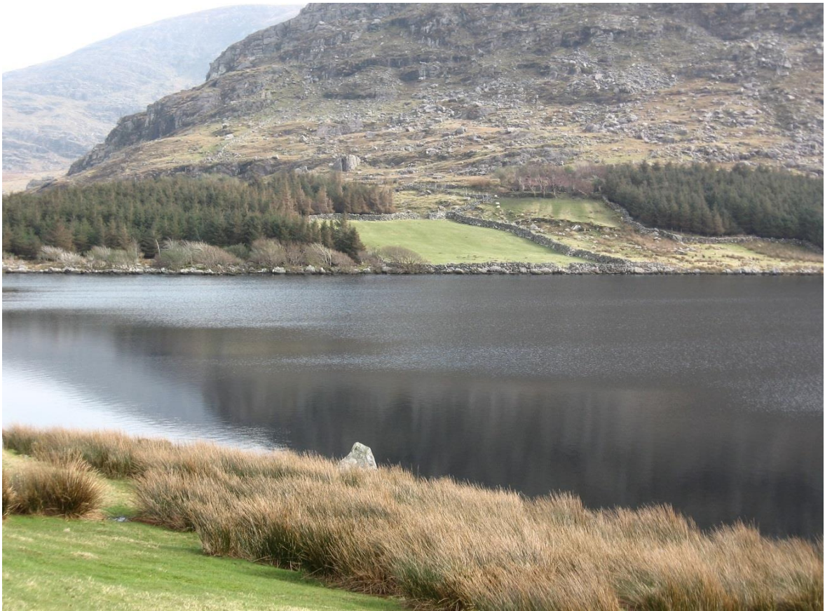
Fig 3. Coomasaharn cirque lake, showing conifer forest plantation and reclaimed green land in the background.

Currently, land abandonment is not a major issue in the valley, in fact parts of the mountain are still overgrazed. But, not only can abandoned land be observed at the entrance to the valley and throughout the Iveragh peninsula, there is a general consensus in the study area that it is what the local people refer to as a 'tipping point', and that the current generation of hill farmers will be the last to farm the mountain in the way they have traditionally done for generations, albeit with adaptations. One is frequently reminded that 'soon there will be no one here' and that the mountain 'will go wild', meaning out of human control, something that is always perceived in negative terms. What is happening in the Coomasaharn-Canearagh valley is typical of many other isolated places throughout the Iveragh and Irish uplands in general.