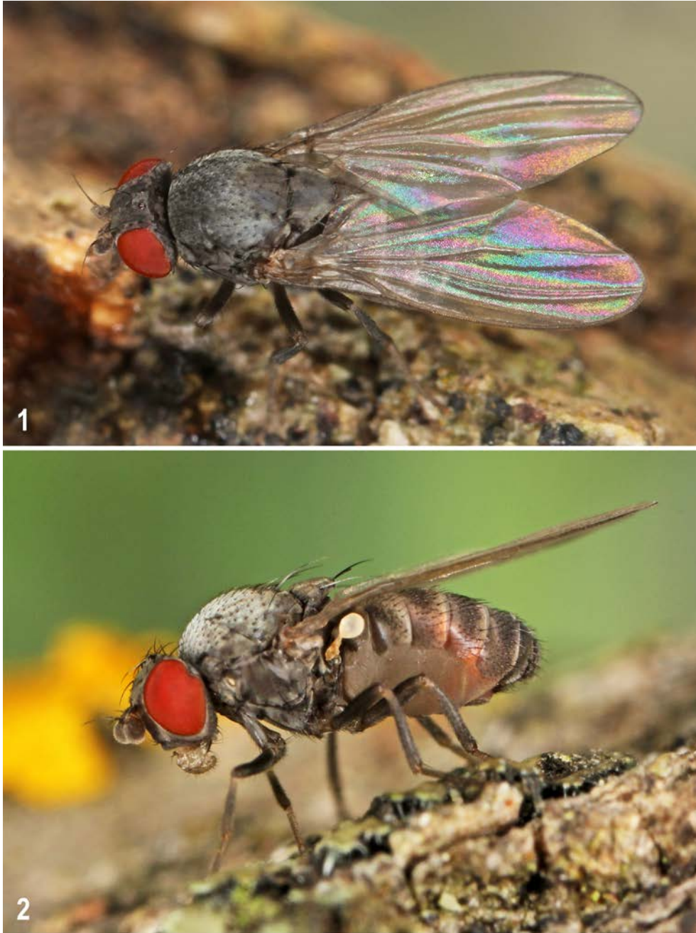
Figs 1-2: Cacoxenus (Paracacoxenus) argyreator Frey, 1932, a living male from the Muránska planina NP (Slovakia). 1 – dorsally, 2 – laterally. Body length ca. 2.8 mm.

Distribution: The species is widely distributed in the eastern part of Palaearctic Region and in some parts of Oriental Region, recently it has been introduced to North America, South America, Hawaii, Réunion and Europe.