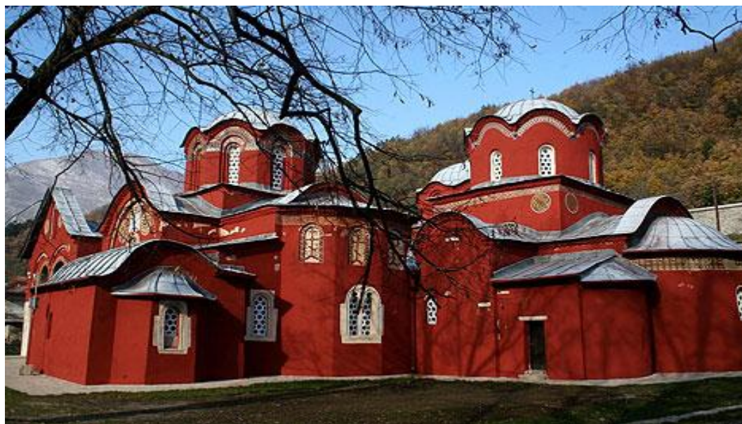
Fig. 1. Patriarchate of Peja (Municipality of Peja, 2018).

The material heritage of the region is represented by Bajrakli Mosque, Haji Bey Hammam, Haji Zeka Mill, Tahir Begu Han (dosshouse), Goskay Tower, Qamil Limani Tower, Zenel Bey Tower, Kurshumli Mosque, Old Bazaar, Patriarchate of Peja. The city with its suburbs is inhabited by about 100 000 people, whilst the city alone has about 60 000 inhabitants. In the last decade there was a large concentration of population in the city due to better living conditions and employment. The city itself is quite attractive. There you can come across different cultures. The population is mixed, where Albanians make up 90 % of the structure, while Serbs, Montenegrins, Bosnians, Roma, etc. make up 10 % of the population structure (Tourist Information Guide, Municipality of Peja, 2018).