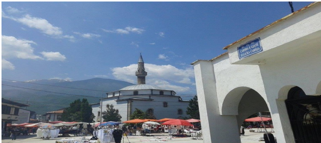
Fig. 2. Mosque Kurshumli.

The first industrial water mill, which belongs to the Austro-Hungarian period, where the entire region has been grinding wheat and producing flour, is under state protection and it serves various exhibitions and visits. Everyone can be a guest, even for free. Since 1977, it is under state protection as a historical monument.