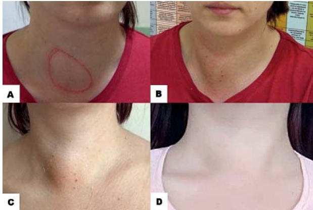
Fig. 3. The patient before RFA (A); 2 hours after RFA (B); 2-nd day after RFA (C); 27 days after RFA (D)

of her neck symptoms and cosmetic complains. She was followed-up by US scan until the first month, when marked, visible and progressive (Figure 3) reduction of nodule size was achieved. The patient's thyroid function was still slightly hyperthyroid but with a tendency to normalization – TSH 0, 19 mIU/L.