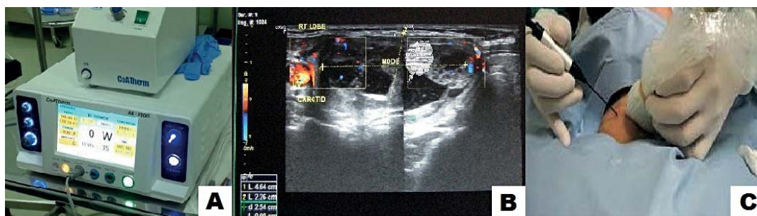
Fig. 2. RFA generator CoAtherm AK, Korea (A); US scan guiding during RFA (B); Start of RFA (C)

The procedure was well tolerated by the patient and no adverse events were noted. After completion of the procedure, the patient was awaked and transferred to a post-anesthesia unit. The sides of fine needle entry-points were visible on the skin of the patient's neck until 5-th post-procedural day. The patient experienced no complains and was discharged from the hospital on the next day (well below 23-hours in-hospital stay) in a self-reporting perfect condition with prescription of TSH control after 2 months. Over the next thirty days, the patient reported a progressive improvement