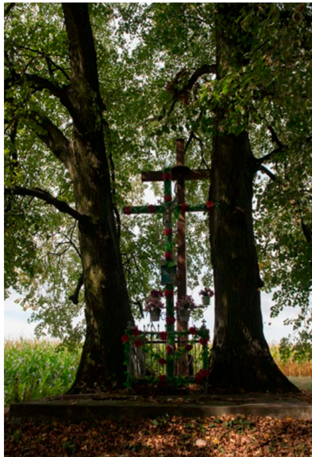
Figure 3 Crosses in Kępa Borzechowska

at crossroads or forks in the road. What is more, 2 crosses and 2 statues are on private properties, and 1 cross is situated in the manorial-park complex in Kłodnica Dolna. The landscape of the Borzechów Commune is dominated by roadside crosses. Among them, over 53 are made from metal, 26 from wood, 5 from stone, and 1 from concrete.