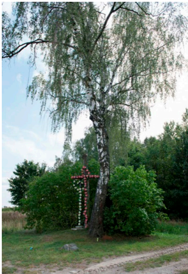
Figure 2 Crosses in Majdan Skrzyniecki Photo: Magdalena Lubiarcz, 2018