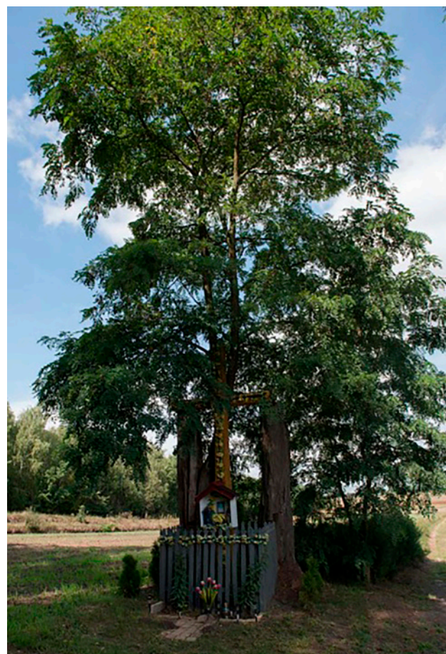
Figure 1 A cross in Łączki-Pawłówek Photo: Magdalena Lubiarz, 2018

The majority – 89 objects are situated in the direct vicinity of roads, where 31 crosses and 1 statue were found