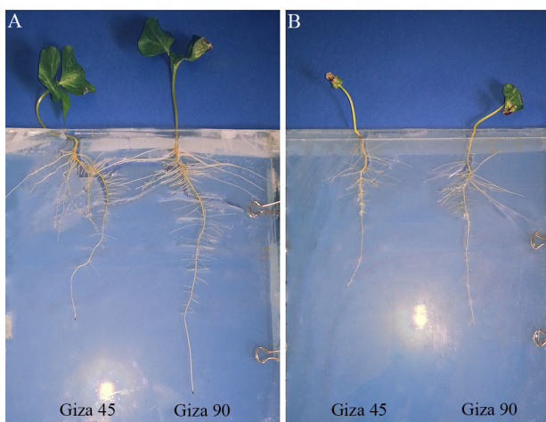
Figure 2. Root system morphology of cvs. ‘Giza 45’ and ‘Giza 90’ cotton plants (14 days age) under A) 150 mM NaCl and B) control conditions (Experiment 2)