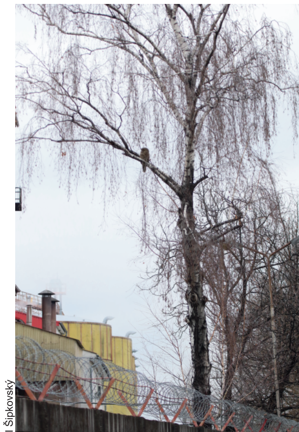
Fig. 1. Ural owl ( Strix uralensis ) sitting in a birch near an industrial building in the town of Hlohovec (western Slovakia).

Obr. 1. Sova dlhochvostá ( Strix uralensis ) sediaca na breze v blízkosti budov priemyselného objektu v meste Hlohovec (západné Slovensko).