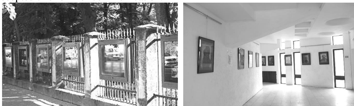
Fig. 12. Galeria de Artă La Gard din Parcul Copou 194 Fig. 13. Casa de Cultură „Mihai Ursachi” Galeria Labirint

Among the private galleries, we mention the Dana Art Gallery, established in 2006. The gallery managed to combine exhibition events with editorial projects, becoming a benchmark for visual art from Iasi. In the more than 15 years of existence of this gallery, have exhibited numerous important artists from Iași and from other localities in the country and abroad. From the series of original galleries, can also be noted the open-air exhibition space Galeria La Gard in Copou Park, which is a place appreciated by both artists and the public who immediately accepted this form of communication.