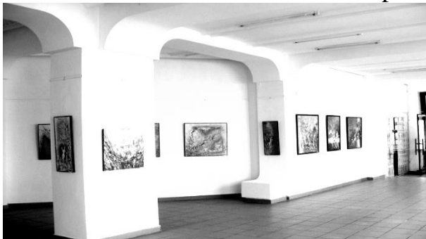
Fig. 2. Galeria de Artă Cupola 187

closed for a long time, but when it reopened it was only a third of the original space, but in 2022 the space closed for rehabilitation. However, several local institutions have looked for different solutions for setting up other exhibition spaces, creating a beneficial environment for the development of artistic life.