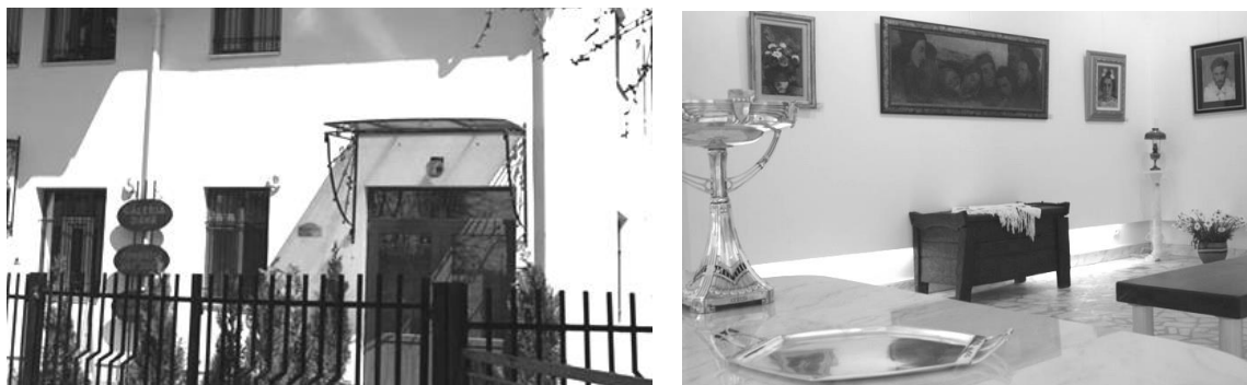
Fig.10, 11. Galeria Dana din str. Cujbă 193

framework of artistic expression to alternative 191 exhibition manifestations. Also malls from Iasi 192 are trying to rally to the contemporary cultural scale. Tus in the commercial areas have been set up spaces dedicated for exhibition events which provide a framework for various individual and collective exhibitions.