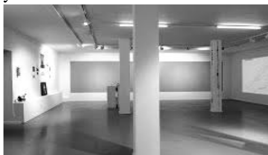
Fig. 6. Galeria ApArte