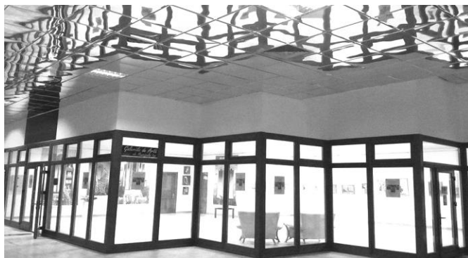
Fig. 4. Galeriile de Artă ale Municipiului Iași