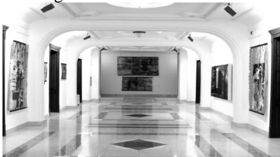
Fig. 5. Galeria Universitas

In this cultural context, also were created the ApArte and Universitas Art Galleries which belong to the George Enescu National University of Arts from Iași. Having generous exhibition spaces, they promote the initiatives of the students from the Faculty of Visual Arts and Design, being also intended for contact with the Iași public regarding the university's artistic and educational activity. Among the most important exhibitions held at the Universitas Galleries were the events of the Euroinvent International Conferences and the International Inventica Symposiums, between 2013- 2022 editions, being one of the exhibition spaces of the 2015, 2017 International Engraving Biennale, as well as other artistic events aimed at contributing to the cultural value of our city.