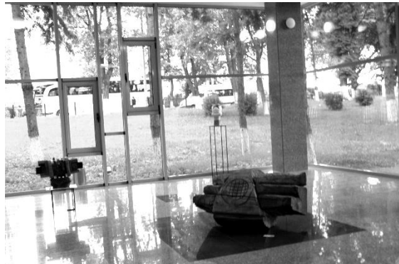
Fig. 7. Sala pașilor pierduți 190 Fig. 8. Galeria de artă Sala de Marmură , Facultatea de Medicină Veterinară, Iași

We also recall the importance of unconventional exhibition spaces, thus, the alternative art galleries (Vector and Tranzit Galleries) have made a considerable contribution to shaping an artistic life, promoting both Iași artists and artists from the country or abroad, by organizing numerous exhibitions, debates, book launches, being a support framework for local cultural values. The alternative art gallery Vector is the first independent space from Iasi for the promotion of contemporary visual arts, supporting the idea of an alternative to the current system of galleries. The projects of the Vector gallery consist in the presentation of exhibitions, the organization of workshops, documentary meetings, conferences, alternative cultural events, with invited local, national and international creators.