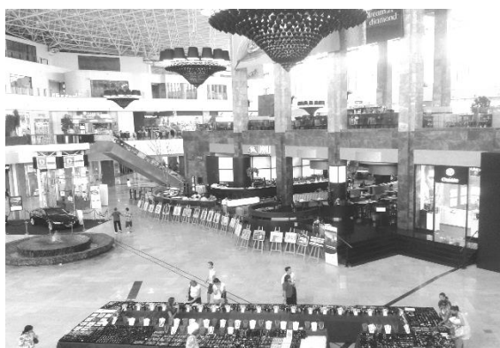
Fig. 9. Spațiul expozițional Palas Mall

The Vector Gallery appeared in 2003 as a result of the establishment of the Vector Association in 2001, being known as the organizer of the Peripheral Contemporary Art Festival. The existence of the Vector gallery was sprinkled with numerous cultural events attended by visual artists from Iași, Cluj, Bucharest, Timișoara, but also from abroad such as Italy, Slovenia, Holland, Great Britain, etc. becoming visible in the European artistic environments.