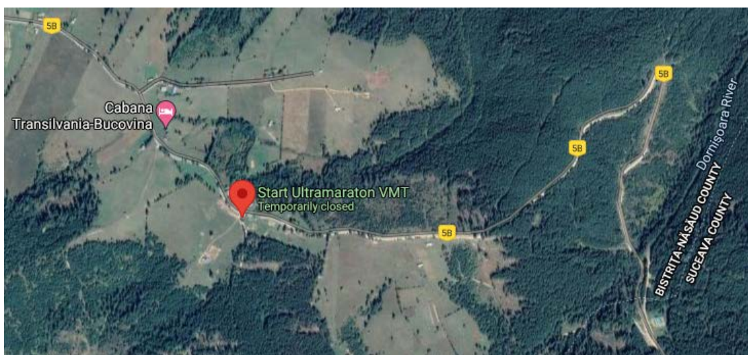
Figure 2: Google Earth location of the Roman Road Maria Theresia (processed using Google Maps)