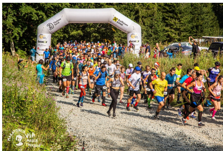
Figure 4: The starting line of the Via Maria Theresia Marathon [16]

The Tășuleasa Social Association, the initiator of the Via Maria Theresia road project, set up, in the smallest details, its organization and logistics, operations, the number of people needed, the route was recognized. In two rows, with GPS devices, the design of markings, signboards, information boards on the history of places in four languages, and many other preliminary operations were performed. For 20 years, Tășuleasa Social has been fighting against massive deforestation, both through afforestation