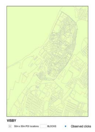
Figure 2. Plan of Visby (left), gridded Potential Points of Interests (middle) and locations where tourists clicked "like" (right)

From each Point-of-Sight, immediate surroundings were scanned using a combination of on-sight observations and photos from several sources, including the project team photos, Google Street View, Eniro Kartor (https://kartor.eniro.se), hitta.se (www.hitta.se), and social media images. Thus, the Potential Points of Interest values were based on what can be seen from each Point-of-Sight and 360 degrees around it. Occasionally the Point-of-Sight was located in a place with restricted or no access. In these cases, the observations were collected from the nearest location being accessible to pedestrians. In the medieval parts of the town (constituting the majority), the alternative locations where always in close proximity and well within each 50x50m grid unit. A few Points-of-Sight in the dock area close to the pier, were located in fenced or otherwise blocked units. These Points-of-Sight were given the likely values (water, and in two cases, planned green space) based on aerial imagery and proximal locations. None of these Points-of-Sight was like-clicked but they were still important as reference values in statistical analyses. In total 582 Points-of-Sight were created to cover the touristic parts of Visby.