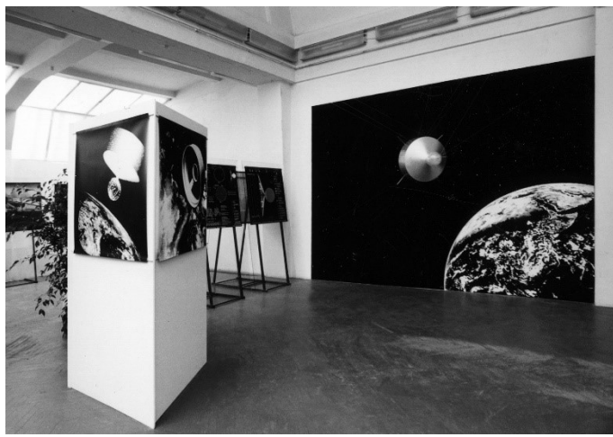
Figure 4: From the exhibition "VAL—Cesty a aspekty zajtrajška", 1996, Umelecká beseda, Bratislava, Slovakia.