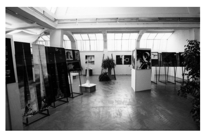
Figure 3: From the exhibition "VAL—Cesty a aspekty zajtrajška", 1996, Umelecká beseda, Bratislava, Slovakia.