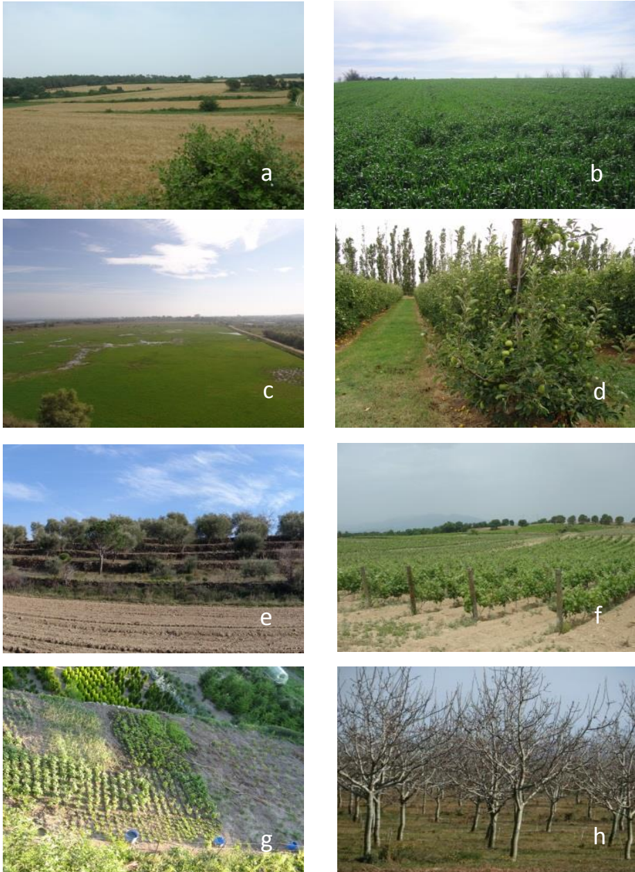
Fig. 2: Landscape photographs used in the survey and presenting different agricultural uses (a-dry herbaceous crops, b-irrigated herbaceous crops, c-grasslands, d-fruit trees, e-olives, f-grapes, g-horticulture and h-nut trees).

We used photos and aerial photography (Google Maps), both in colour, to support the questionnaires (Figures 2 and 3). Photos were taken at the same time of the year (winter).