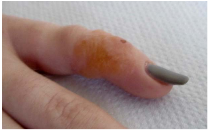
FIGURE 5. Tumoral lesion on the fifth left digit

langeal joints, the dorsal aspect of the proximal interphalangeal and metacarpophalangeal joints; often the lesions extrude a white, chalky material (Figure 2). Rheumatoid nodules are well-demarcated, mobile, firm, asymptomatic subcutaneous nodules on the extensor surfaces of the elbows and fingers, occurring in patients with rheumatoid arthritis (Figure 3). Other diagnoses that are to be excluded include: foreign body granulomas, represented by a solitary inflammatory plaque or nodule, associated with pain and tenderness, localized on the site of a previous traumatic lesion (Figure 4); tumors, which