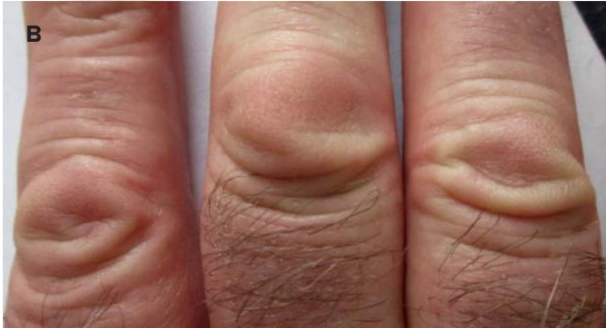
FIGURE 1. A – Well-circumscribed thickening of the skin over the extensor surface of the dorsal aspect of the metacarpophalangeal joints (knuckle pads); \mathbf{B} – thickening of the skin on the interphalangeal joints ("diabetic finger pebbles")

cally distributed over almost all digits (Figure 1 A, B). Knuckle pads have been described mostly in men, in the