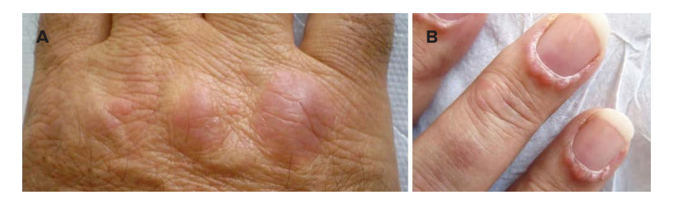
FIGURE 6. Gottron papules – erythemato-violaceus nodules over the extensor surfaces of metacarpophalangeal and interphalangeal joints, associated with similar lesions around the nails ( A , B )

Laboratory tests are of great value for confirming the diagnosis of knuckle pads.