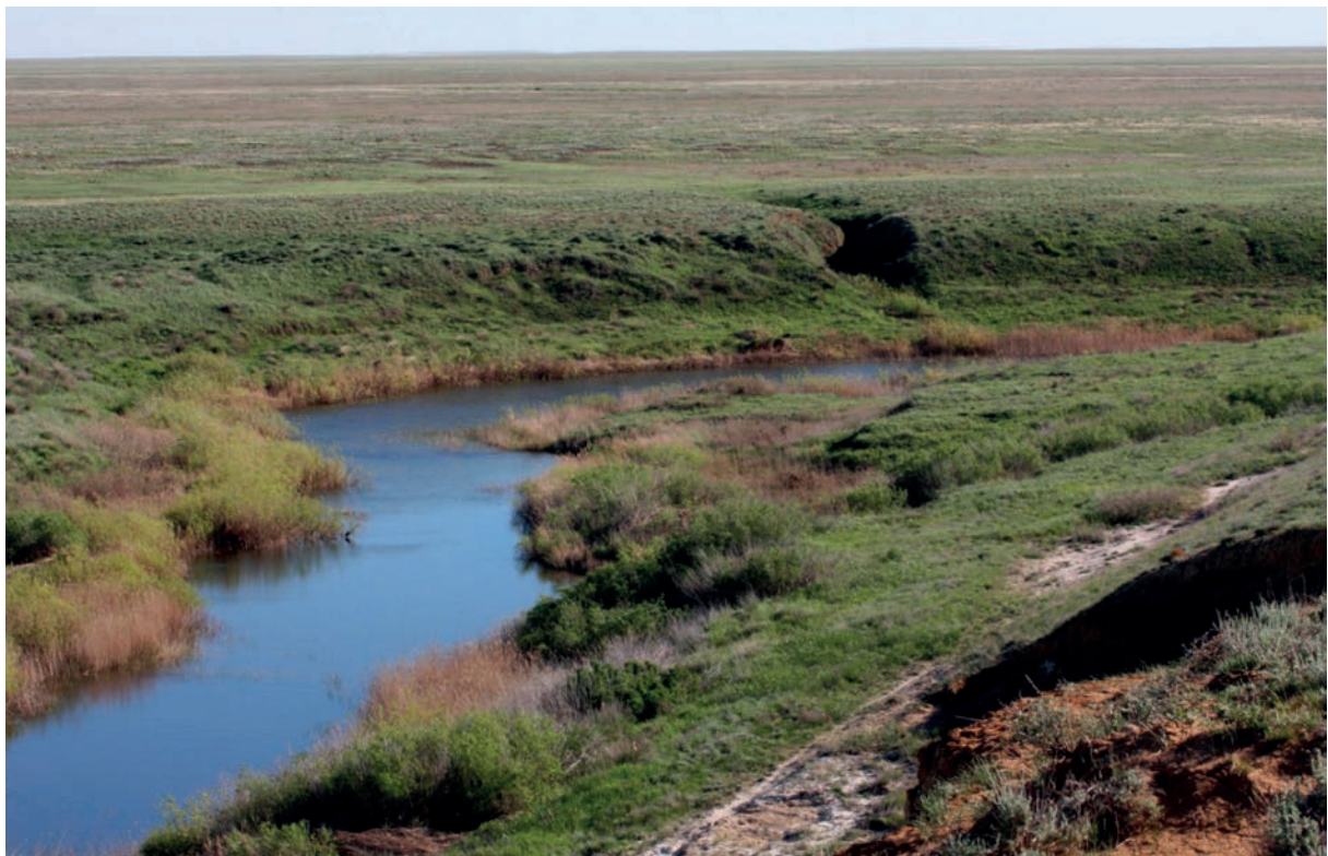
Figure 2: River Uly-Zhilanshik. Kostanay Province. State Nature Reserve “Altyn Dala”. Kazakhstan. 10.05.2013. Slika 2: Reka Uly-Zhilanshik. Provinca Kostanaj. Državni naravni rezervat “Altyn Dala”. Kazahstan. 10.05.2013.