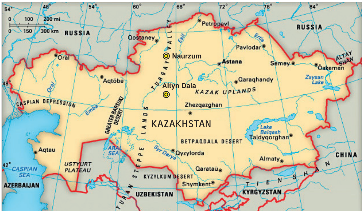
Figure 1: The investigated area with the location of the Naurzum Reserve and the Altyn Dala Reserve. Kostanay Oblast, Kazakhstan. Slika 1: Preučevano območje z lokacijama rezervatov Naurzum in Altyn Dala. Oblast Kostanaj, Kazahstan.