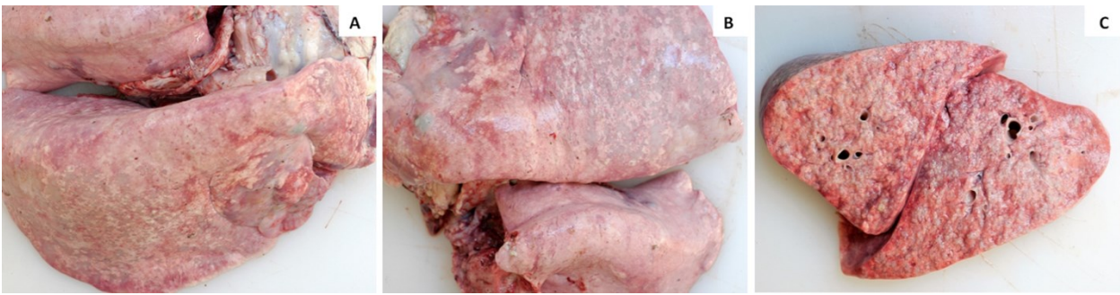
Fig. 1. Macroscopic appearance of the lungs. A – grey-white tumoural foci on a diaphragmatic lung lobe; B – large foci consisting of merged small foci; C – effusive greyish tumoural foci in cross-section of the lung